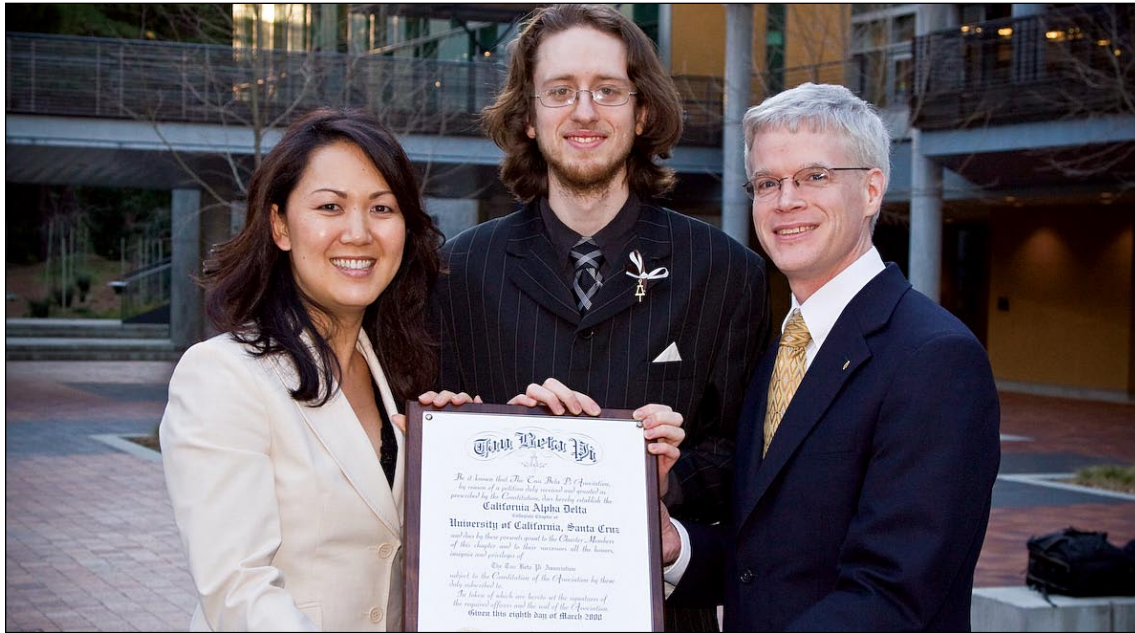
INITIATION PHOTOS: MATT FITT PHOTOGRAPHY